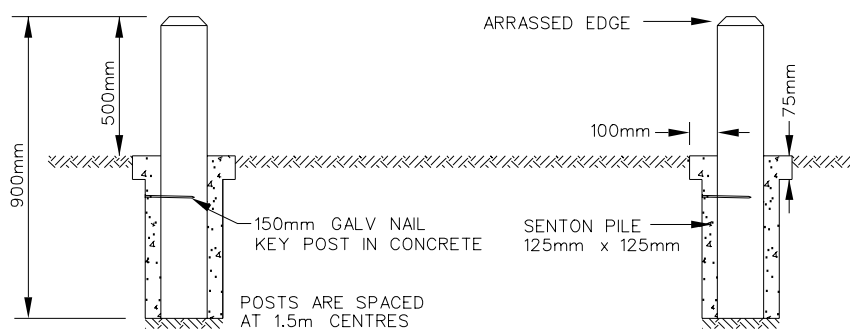
BARRIER END AND STANDARD POST DETAIL ELEVATION