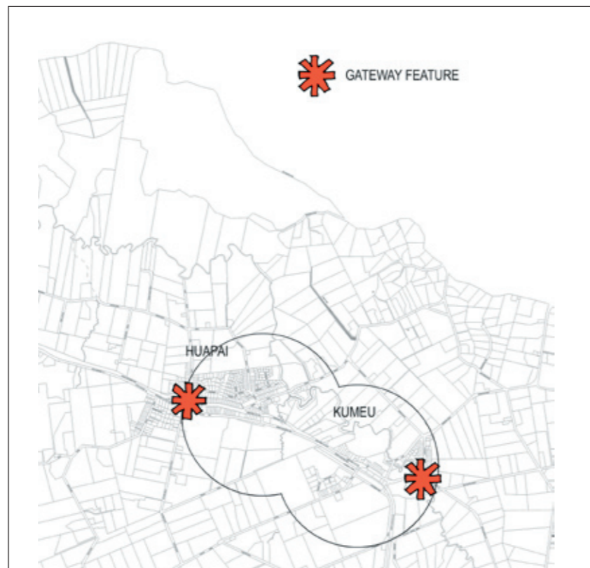
Figure # 17: Kumeu - Huapai Central Area Plan Gateways Strategy