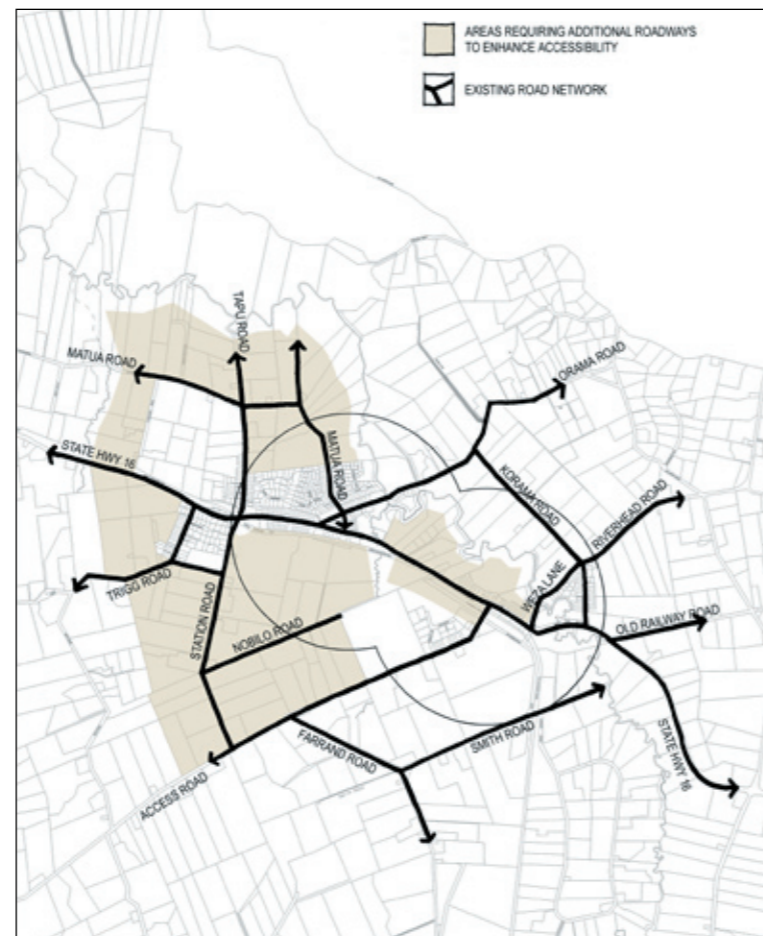
Figure# 14: Kumeu-Huapai Central Area Plan Roading Network