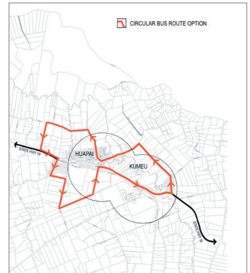
Figure# 15: Kumeu-Huapai Central Area Plan Circular Bus Route